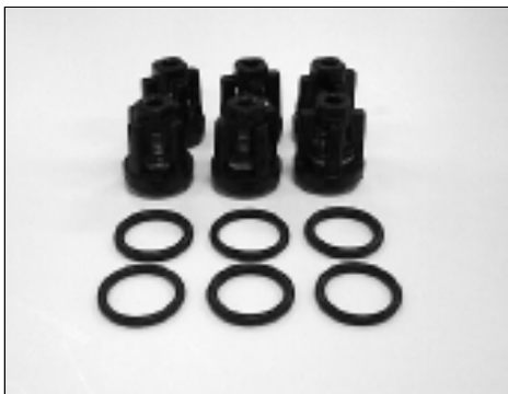
16026 Valve Kit