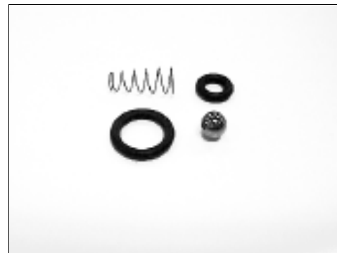
16028 Injector Repair Kit