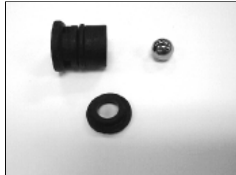
16029 Unloader Set Kit