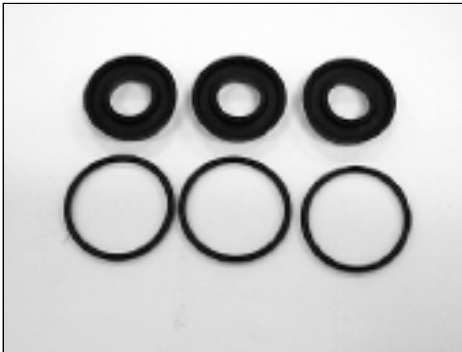
16032 Water Packing Kit