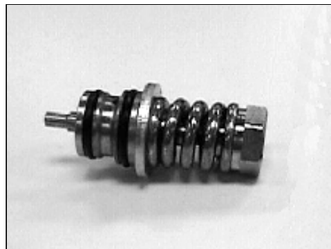
16030 Unloader Stem Kit