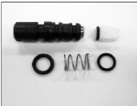
16027 Unloader Check Kit